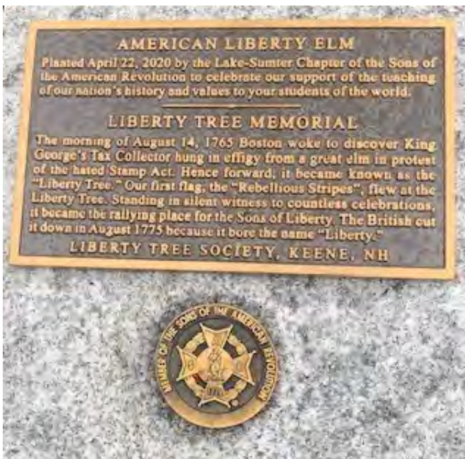
Historic plaque installed at Liberty Tree.