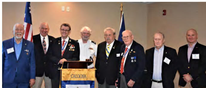
For Veterans Day the Caloosa Chapter salutes all Veterans who served our Country. These are the Compatriots who were present.